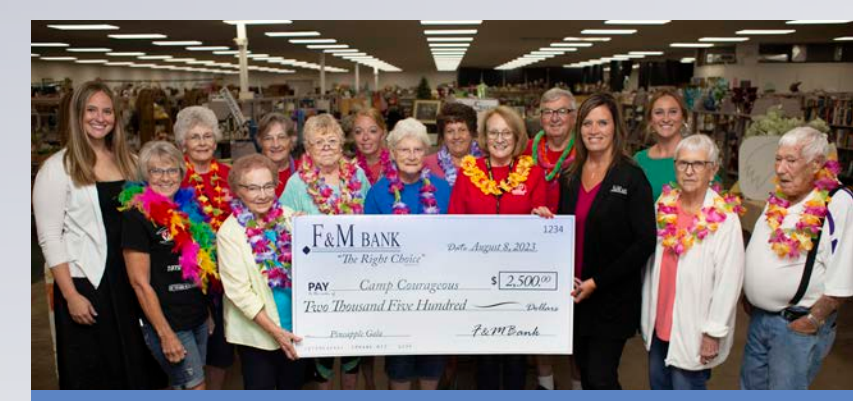
CAMP COURAGEOUS PINEAPPLE GALA | F&M Bank treated the Manchester Garage Sale volunteers to the 2023 Pineapple Gala. Event proceeds benefit Camp Courageous, a year-round recreational and respite care facility for individuals of all ages with special needs.